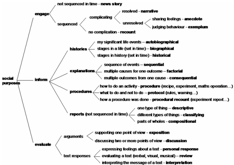
Figure 2. Map of genres in school (Rose & Martin, 2012, p. 128).

Literacy learning in the content classroom is therefore connected with the integration of subject-specific semiotisations into the learner's everyday knowledge, into their active use in subject-specific discourses and in their subject-related everyday discourse. In the case of CLIL, 'literacy' also entails the capacity to describe and explain symbolic representations and forms (like, e.g. a curve diagram or a map) in a second or a foreign language, in the main language of instruction and/or in one's native language. The latter elements of subject-specific literacies obviously also require meditational competences, or skills that allow learners to translate content matter from and between all the different languages that are involved in literacy learning in a content subject. (p. 196)